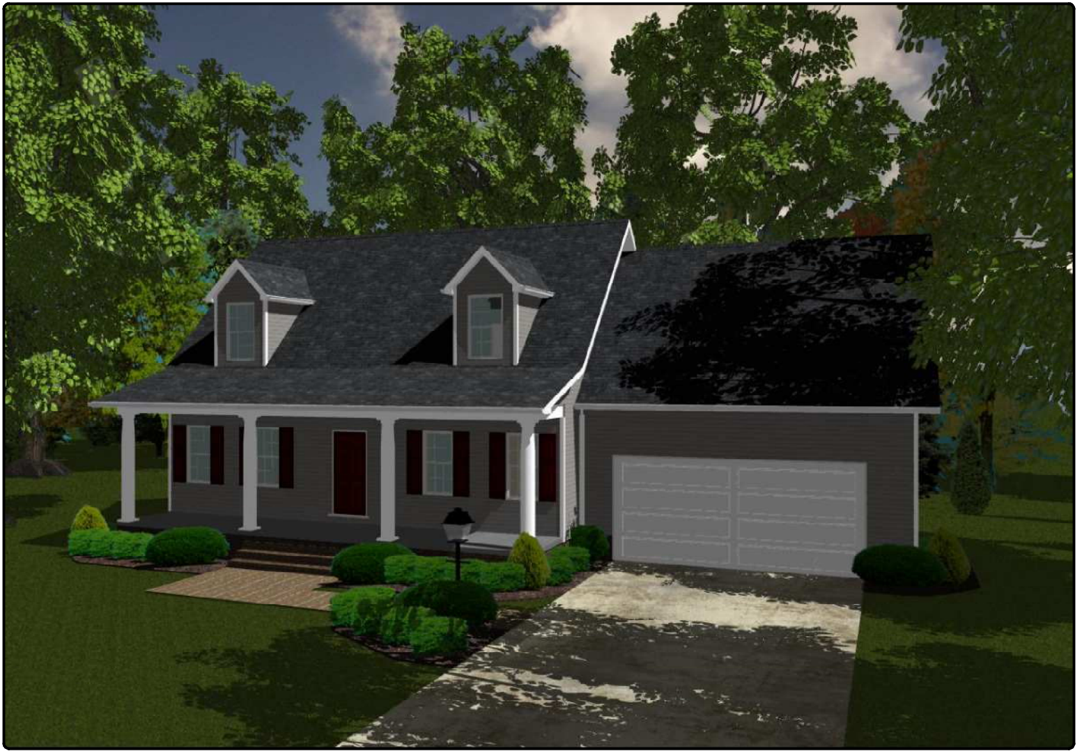
THE CAPE II 1638 SQ. FT. 4 BED 2.5 BATH